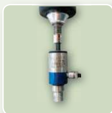
EXTERNAL ROTARY TRANSDUCER