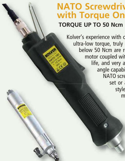
NATO for automation with suction head (optional)

NATO screwdrivers range in torque from 1 to 50 Ncm, and feature an ESD-safe housing and cord set or aluminium body (20mm diameter), for fixture mount applications. Drivers are inline style, with a lever start actuation. NATO systems are available with our 8 P-set programmable controllers for maximum versatility. Foot pedals are available in cases where the operator would like the convenience of manual operation with the NATO/CA series.